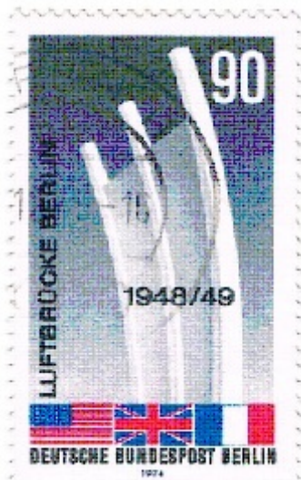
Figure 3 Scott # 9N346 Airlift Memorial issued April 17, 1974

As stamp collectors we can come across all sorts of interesting subjects on stamps, some familiar and some not. I acquired some stamps from Berlin that featured an odd looking object with the word luftbrücke on them. After a while I figured out that luft means air and brücke is bridge, okay but what is this thing on the stamps...a