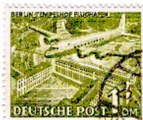
Figure 4 Scott # 9N57 showing the Tempelhof airport from the air issued June 17, 1949.

The events unfolding in Berlin were considered the first serious crises of the Cold War. Some participants on both sides wanted to attack but war would not have been good for anyone. No longer a Little Air Lift ; the Berlin Air Lift (or Air Bridge ) began on a much larger scale. The Berlin Blockade cut off all access by land and water. It was calculated that West Berliners required 1,534 tons of food and 3,475 tons of gas and coal daily, definitely a monumental task to be carried out by air only!