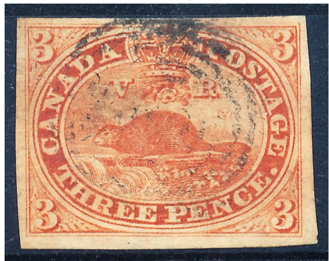
Figure 11 The iconic Canadian stamp, the 3 penny Beaver. Designed by Sir Sandford Fleming. A really interesting Scottish Canadian who was involved in many things, including the Canadian Pacific Railway