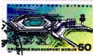
Figure 5 Scott # 9N349 Showing the reconstructed Tegel Airport which officially opened Nov 1, 1974. The stamp was issued Oct 15, 1974

onslaught of cargo and air traffic. Here the French stepped up to the plate and built the Tegel airport in just 90 days. It was built mostly by women by hand and even the building supplies for the airport had to be flown in. The Tegel airport remains as